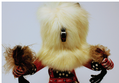
Southwest Kachina Dolls

Additional accessions include international musical instruments, Mexican Oaxaca carved figures, baskets, and various adult and children's traditional clothing. If you're interested in coming to look at our collection to see some of these new additions, please send us an email!